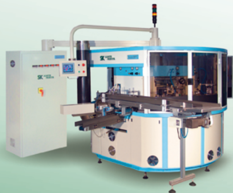
RUV-536 Five Color